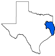
Table 1 - City of Port Neches Population by Decade